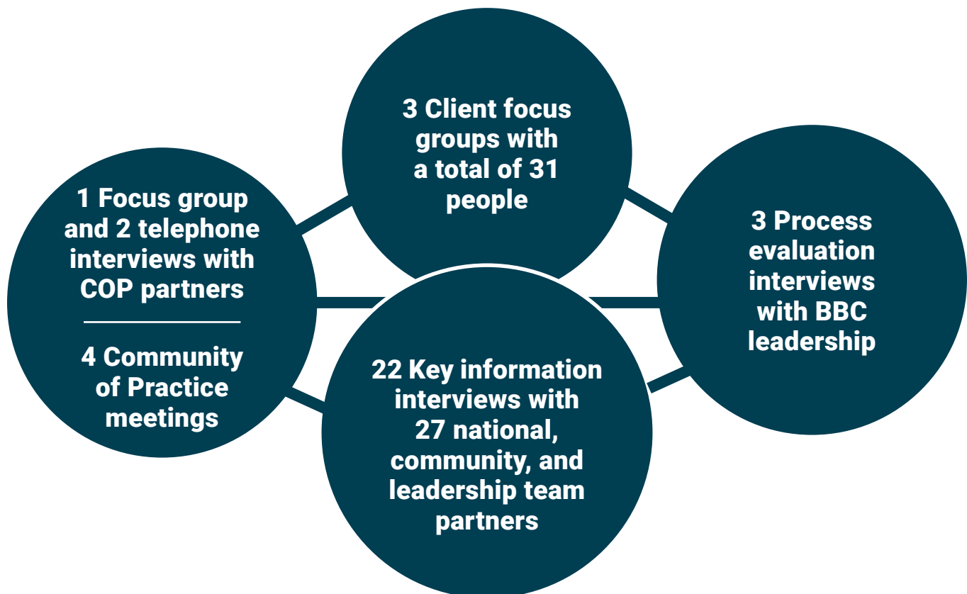
Figure 4. Data Collection

IASP researchers collected the primary data for this report by conducting interviews with key partners