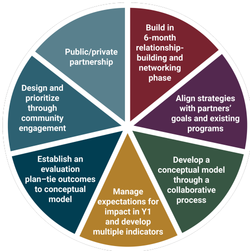
Figure 2. Processes