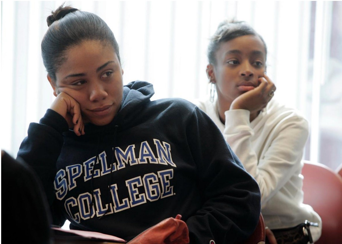
Freshmen students at historically black Spelman College in Atlanta.